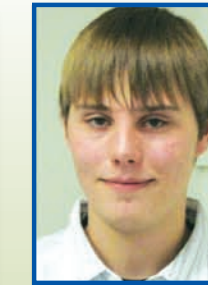
Kyle Stoker Tri Star Career Compact $2,000